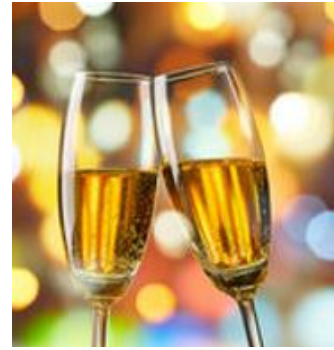
Follow the rules!