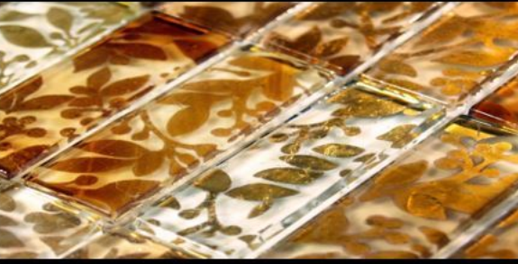
Sometimes it's glass..... Murano glass!

Since the beginning of time, glass has always charmed man, who attributed some magic and supernatural powers to this transparent material. In fact, in legends, the future could be predicted by magicians using a crystal sphere. Glass is synonymous with beauty.